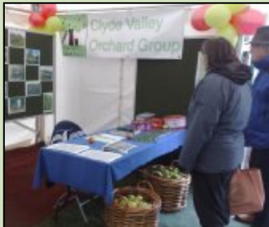
CVOG stall at the Fruit Day