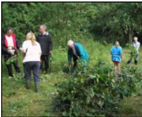
Plum pruning workshop in July