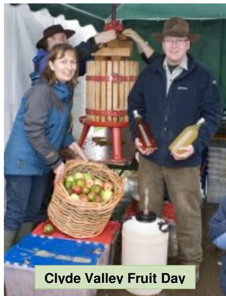
Clyde Valley Fruit Day